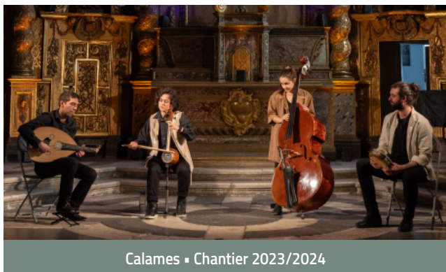
Calames • Chantier 2023/2024