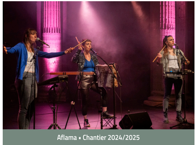
Aflama • Chantier 2024/2025