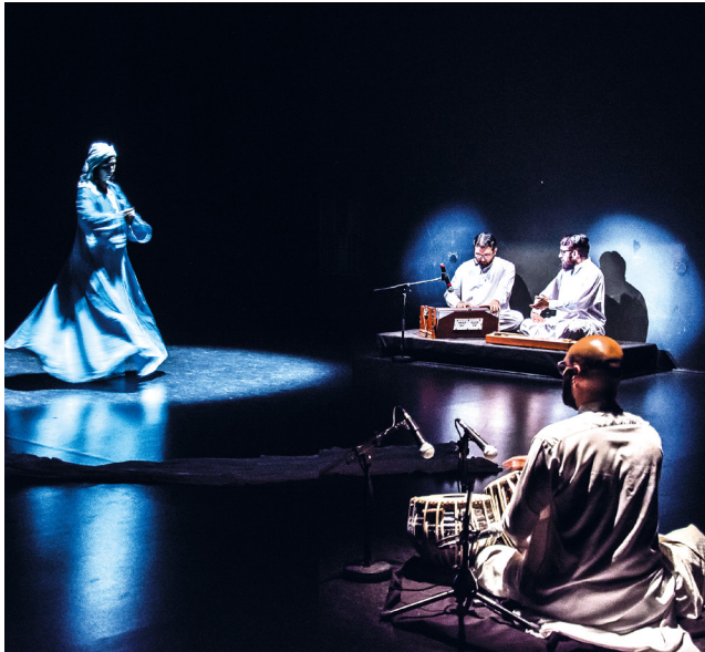
« Noor » • Chantier 2018/2019