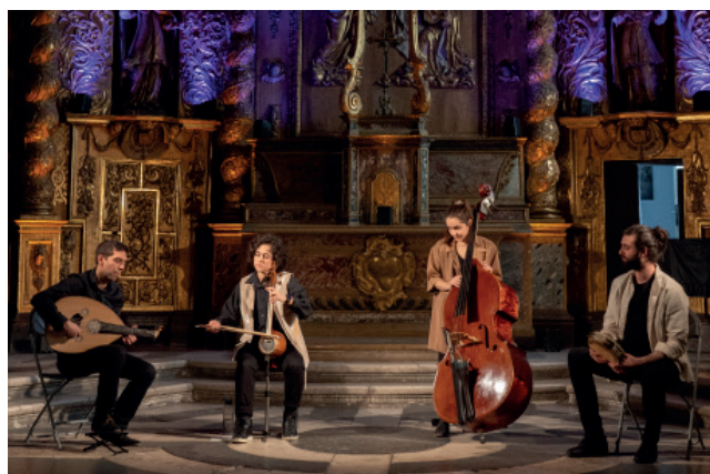
Calames ■ Chantier 2023/2024