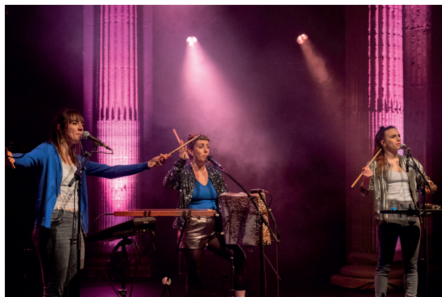
Aflama ■ Chantier 2024/2025